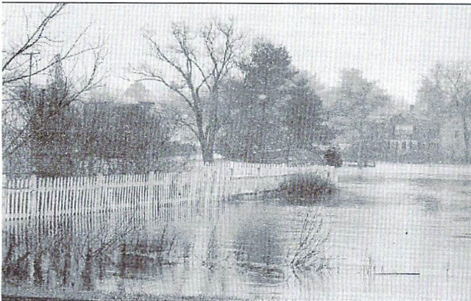
No longer a road, just a sea of water.